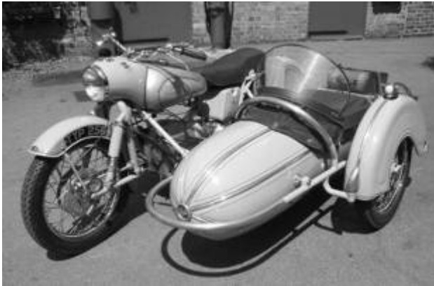
1957 Douglas 500cc Dragonfly Special

The aim of the club is to encourage motorcycling and the camaraderie that goes with it. In particular, the use of classic motorcycles, be they 50 year old British, middle of the road Russian or 5 year old Japanese, so that the skills and innovations of generations of craftsmen are not lost forever in the scrap pile of modern society, but are preserved for generations to come.